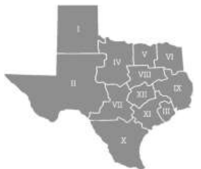
Texas FFA Area Association Map: Texas FFA is divided into twelve administrative areas which are broken along county lines and described in the Texas FFA bylaws.

The state is divided into twelve administrative areas which operate as semi- autonomous associations. Texas has had as many as 12 areas and for many years, these areas were a function of state education agency staffing. At one time, each of these areas was the territory for an area supervisor who provided direct oversight of local departments in their respective area. Currently, each area has a leadership structure headed by an area coordinator and/or area teacher president. Each area is further divided into districts. The number of districts per area ranges from four to seven, and there are 66 districts in the state. According to the state bylaws, the state must consider re-alignment at least every ten years and the areas must consider redistricting at least every five years. On July 13, 2016, during the 88th convention business session, delegates across the state voted in favor of area realignment which would add two new areas to the association. In July 2018, Texas FFA increased from 10 to 12 areas.